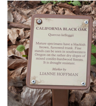
There are 224 interpretive signs.

The mission of the organization is first to grow, display, and maintain native plants of Oregon in the Arboretum in the Dallas City Park. Second, to provide educational opportunities to any