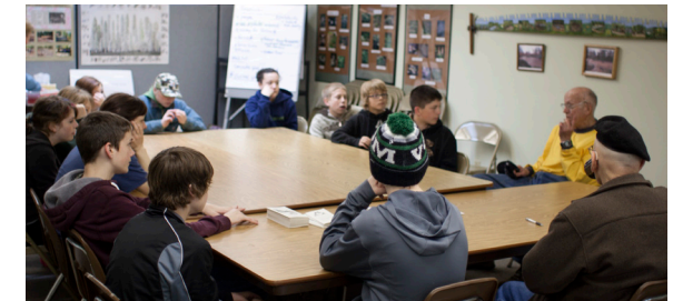
Lacreole Middle School volunteers take a mid-morning break after spreading cedar tow and planting Oregon Grape.

person who wishes to participate in the recognition, appreciation, preservation, scientific study, or landscape use of native plants. Finally, to promote public interest in and to raise funds for the accomplishment of these objectives.