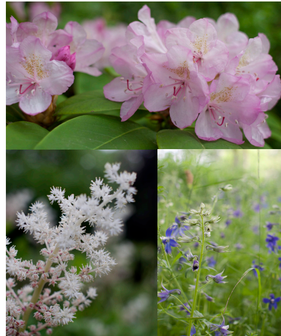
Rhododendron, False Solomon's Seal and Larkspur